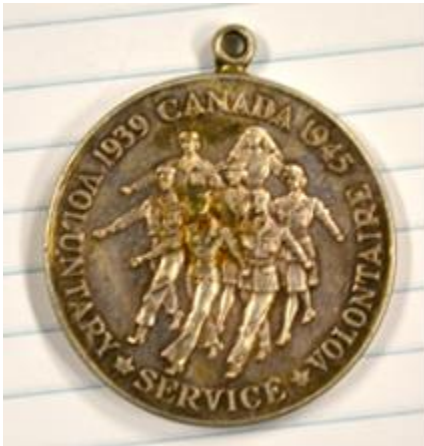
Volunteer Service Medal

The RCMP is hoping to find the owner of a coin collection, including a “Volunteer Service Medal” amongst other things. Recognizing both the monetary and the highly sentimental value this collection likely has, the RCMP is putting out this request for help.